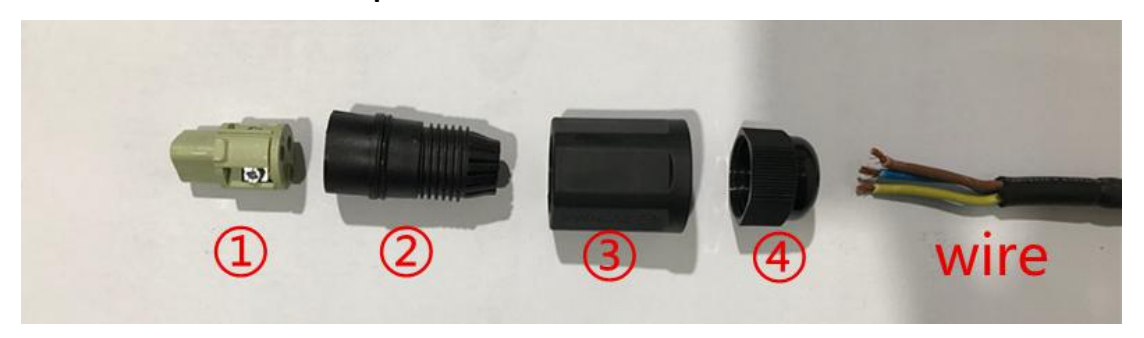
Step 1: Prepare a wire, and connect the part ① with wire, please make sure L to L, N to N, grounding wire to grounding wire, and tighten the screws on part ① as below figure 1 and figure 2 show: